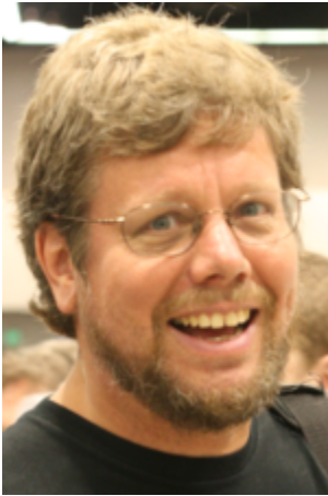
Guido van Rossum

Python is an interpreted, high-level, general-purpose programming language. Created by Guido van Rossum and first released in 1991, Python's design philosophy emphasizes code readability with its notable use of significant white space.